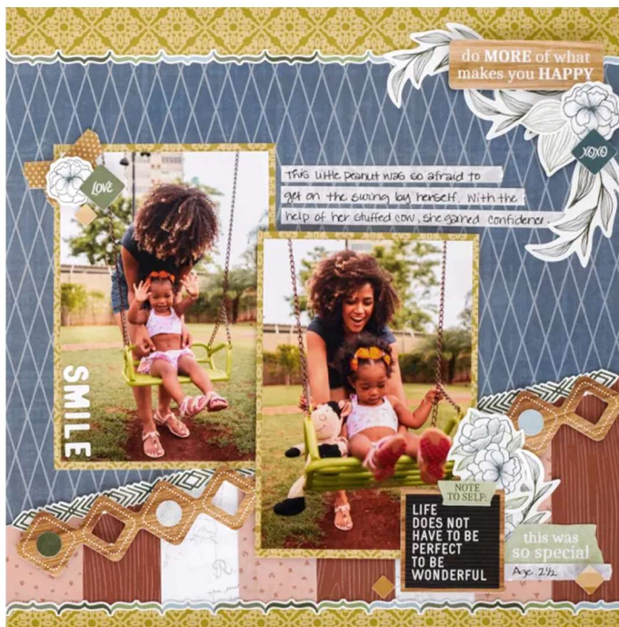
Sample layout and blog directions use the Our Moments papers with the Simple Moments sticker pack.