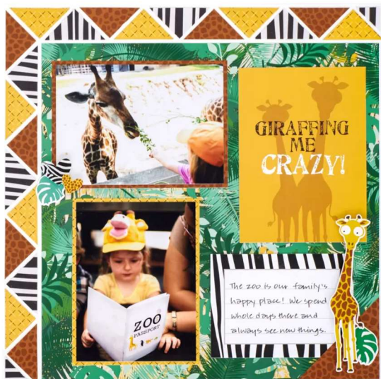
Sample layout and blog directions use the What a Zoo, Too collection.