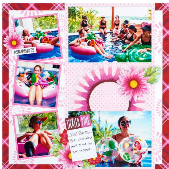
Sample layout and blog directions use the Vivid Melodies collection.