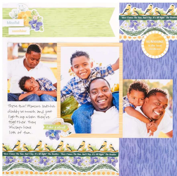
Sample layout and blog directions use the Endless Meadows collection.