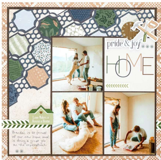
Sample layout and blog directions use the Welcome Home papers and stickers.