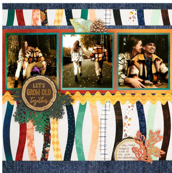
Sample layout and blog directions use the Golden Harvest collection.