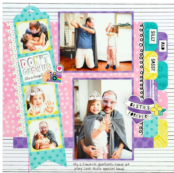
Sample layout and blog directions use the Super Duper Girl papers and stickers.