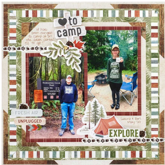
Sample layout and blog directions use the Happy Camper papers and stickers.