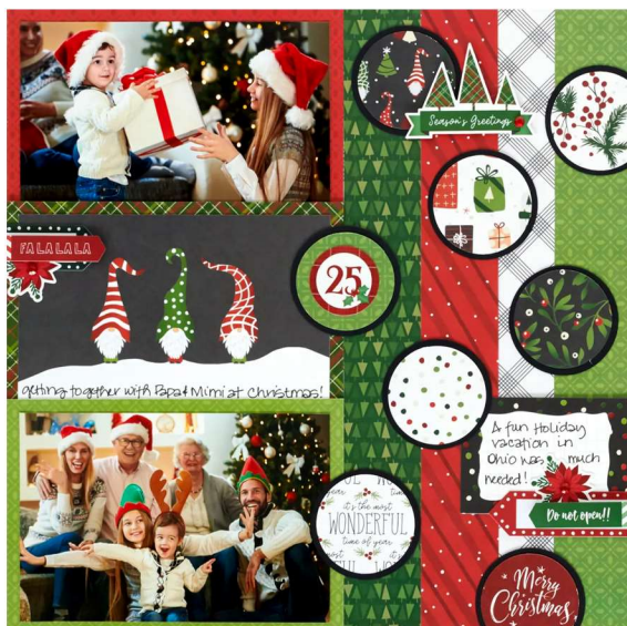
Sample layout and blog directions use the Merry Little Christmas collection.