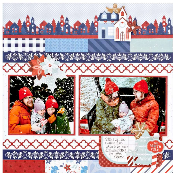
Sample layout and blog directions use the North Pole Magic papers & embellishments (2019).