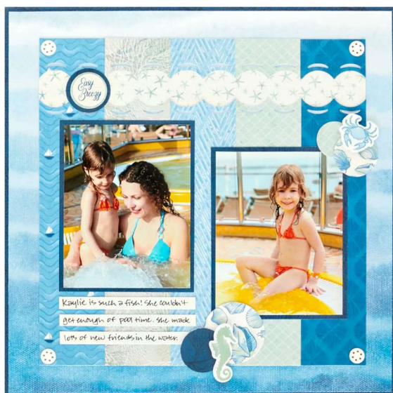
Sample layout and blog directions use the Deep Blue Sea (2019) collection.