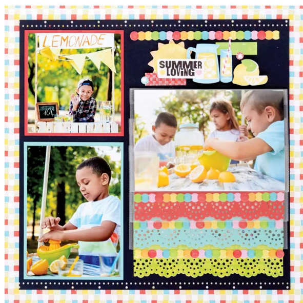
Sample layout and blog directions use the Citrus Summer (2019) collection.