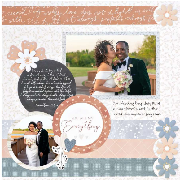
Sample layout and blog directions use the All My Love (2020) collection.