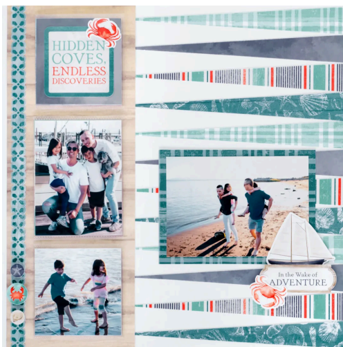
Blog sample uses the Coastal Shore collection